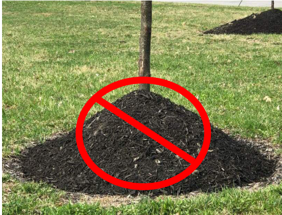
This volcano mulching madness has to stop. Just say no to volcano!

While organic mulches must be replenished over time, buildup can occur if reapplication outpaces decomposition or if new material is added simply to refresh color. Deep mulch can be effective in suppressing weeds and reducing maintenance, but it often causes additional problems.