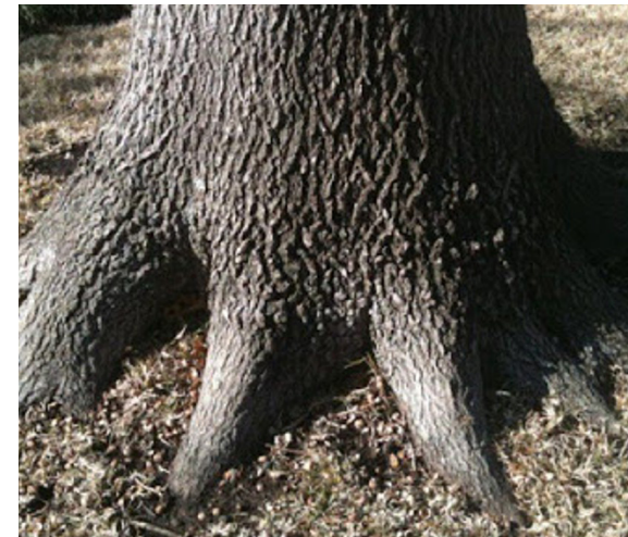
Mature tree with proper root flare exposure.

• If mulch is already present, check the depth. If sufficient mulch is present, break up any matted layers and refresh the appearance with a rake. Some landscape maintenance companies spray mulch with a water-soluble, vegetable-based dye to add color to faded material.