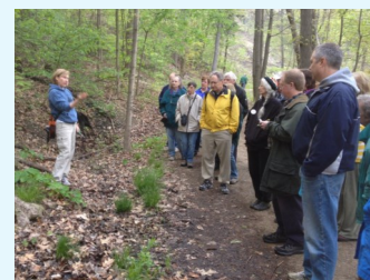
Friends of Euclid Creek monthly meetings include speakers, picnics and hikes

Attend one of Friends of Euclid Creek's meetings, tours or hikes or become a member to help build our organization (more information on back page). Provide input on projects and programs by serving on the Board or on one of our committees. 2016 is focused on our Membership and Board Development committees.