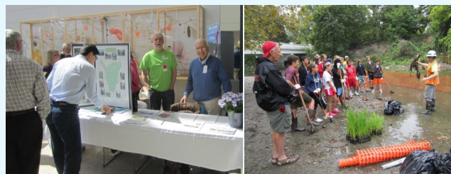
Euclid Creek Watershed Table at Community Event & Volunteer Wetland Planting

Help us spread the Euclid Creek awareness message at environmental and community events and festivals. Volunteers are needed to staff the Euclid Creek table at community events and to volunteer at cleanups and planting events. Assistance provided at first event.