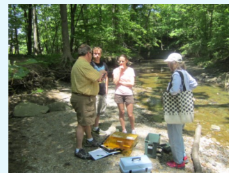
Volunteer Monitoring Training

We monitor five sites along Euclid Creek since 2006, and data helps us understand water quality trends and potential problems. We sample for water chemistry. Training provided.