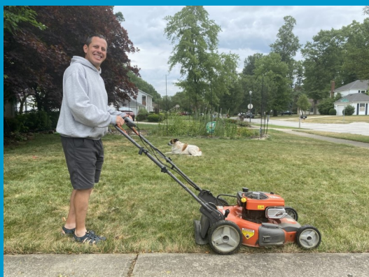
Mulch into the Lawn