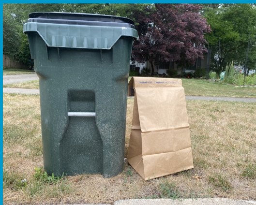
Put Out with Trash