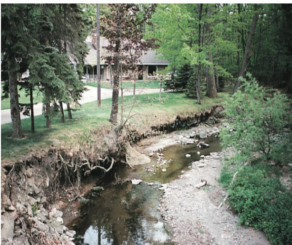
CUYAHOGA SOIL & WATER CONSERVATION DISTRICT