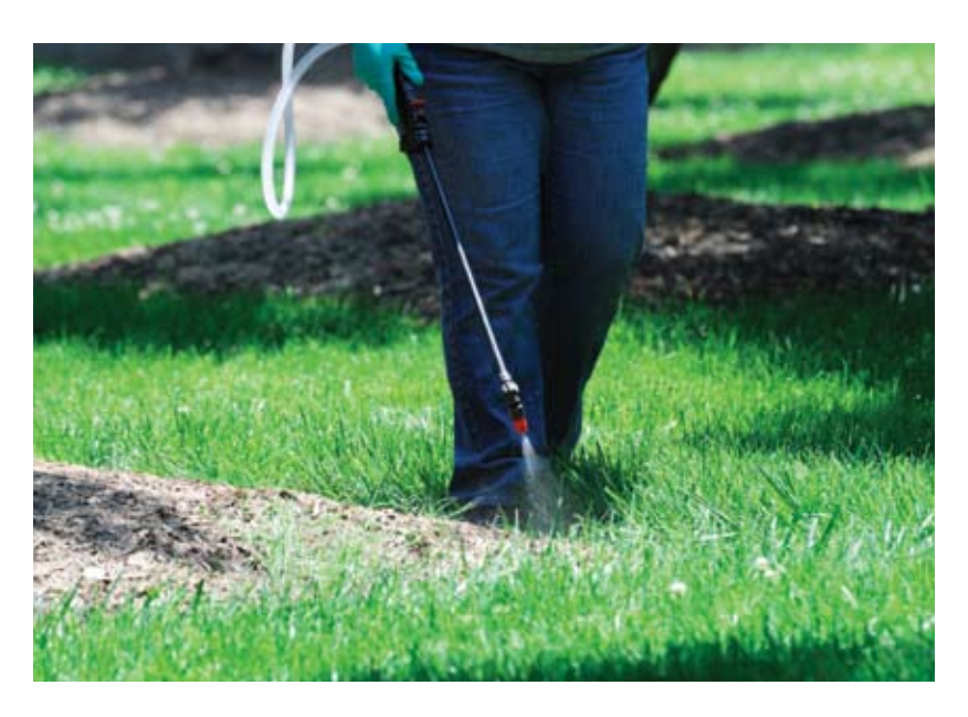
LEARN MORE ABOUT INTEGRATED PEST MANAGEMENT www.epa.gov/opp00001/factsheets/ipm.htm

Integrated Pest Management (IPM) uses information on the life cycles of pests, their interaction with the environment, and available pest control methods to manage pest damage with the least possible hazard to people, property, and the environment.